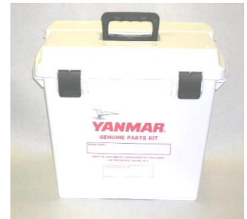
MACK727 DRYBOX (18L x 15H x 12W)