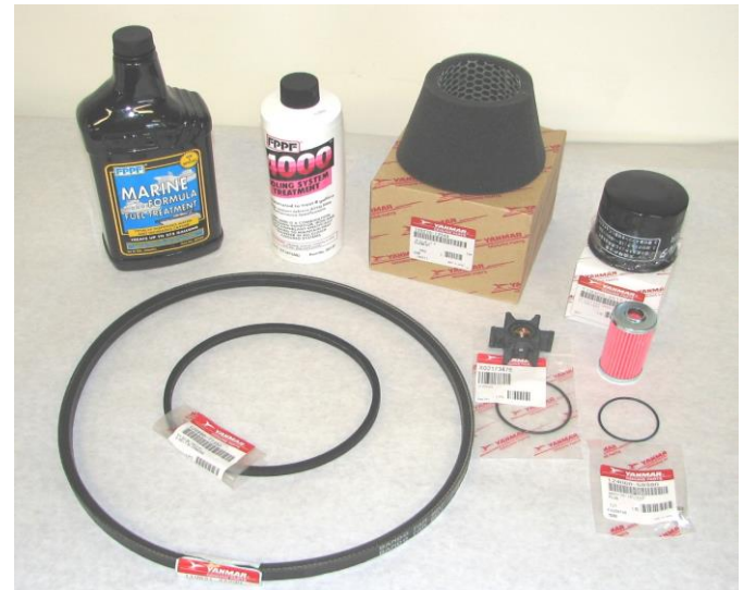
3YM30 MINOR KIT

Be sure to give model, serial number, and application with your order.