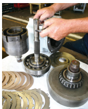
Mack Boring's Marine Transmission Center is staffed by expert technicians.